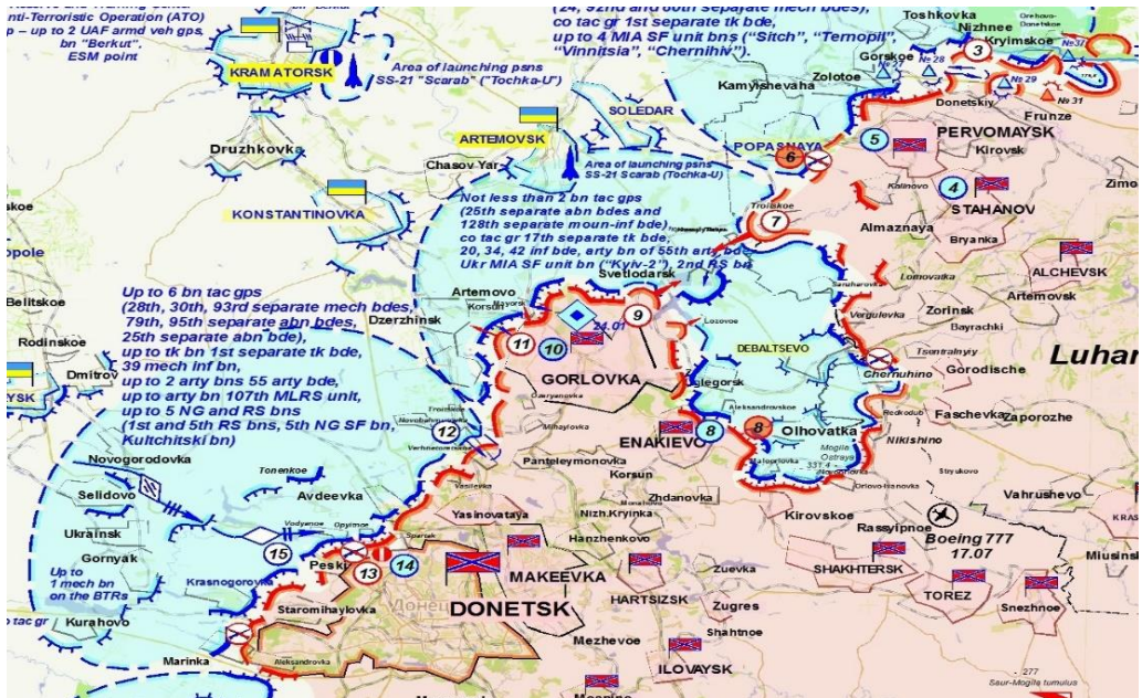
Figure No. 2. The Debaltsevo Pocket 23

Late in January, Russia's hybrid occupation forces launched an offensive on the Debaltsevo bridgehead, trying to surround and destroy the Ukrainian troops located there. For this purpose, the enemy concentrated significant forces of the Russian Federation's regular troops and the most combat-ready illegal armed formations of self-proclaimed "republics" (see Figure No. 2 ). The strength of enemy troops reached 7-9 thousand people, supported by up to 120 tanks, 180 artillery systems, 60 multiple launch rocket systems. 22