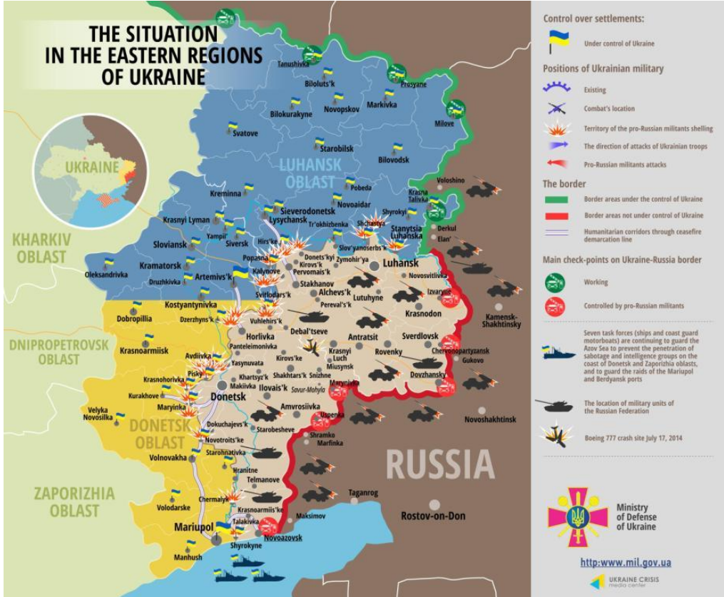
Figure No. 3. The situation in the Eastern Regions of Ukraine in September 2015 (from the daily official report on MOD website) 31

Ukraine in the eastern region. Numerous facts of issuing Russian passports to Ukrainian citizens living in the occupied territories reinforce Russian aggression's hybrid nature. 30